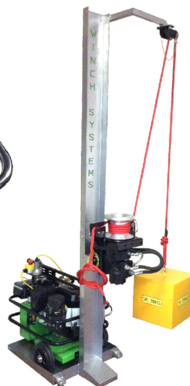
Used with GH200