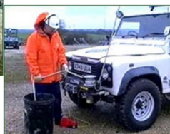
4 x4 Vehicle