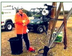
Pylon Leg Mount